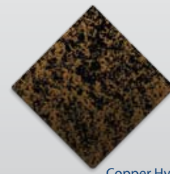
Copper Hybrid (Custom)